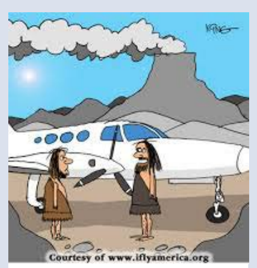
"After inventing the wheel, I thought I'd add something fun to go with it."