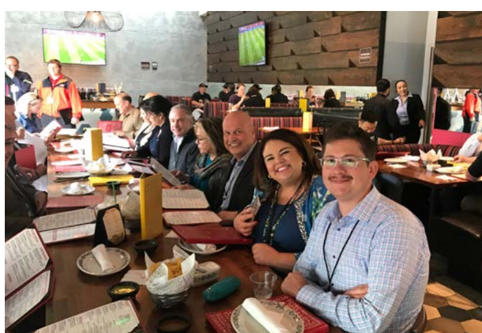
Above & Left: AzAA members get together for lunch during the FAA Western-Pacific Conference in Torrance Beach, CA (June).