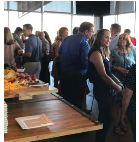
Above: Having fun at Scottsdale Airport's Volanti Restaurant in June (AzAA's Summer Networking Event).