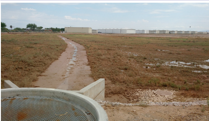
Drainage improvements in action at CHD after a significant rain event.

Congratulations to these airports and partners for their outstanding work!