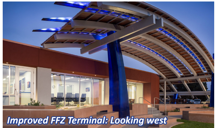
Improved FFZ Terminal: Looking west

This has been a tremendous and noteworthy month for Arizona's airports. Several of our fine airports were recently honored with high-profile recognitions and awards through the American Council of Engineering Companies - Arizona (ACEC-AZ) and Engineering News Record (ENR) Southwest for completion of some outstanding projects: