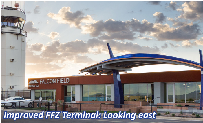
Improved FFZ Terminal: Looking east